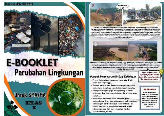
Figure 2. After Revision